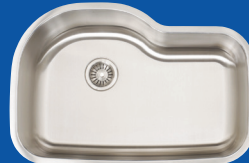
AR3120-D10 28-7/8" x 18-15/16" x 10" D