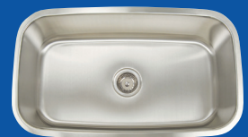
AR3118-D9 29-1/2" x 16-1/8" x 9"