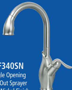
AF340SN Single Opening Pull Out Sprayer Satin Nickel Finish