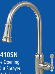
AF410SN Single Opening Pull Out Sprayer Satin Nickel Finish