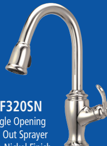
AF320SN Single Opening Pull Out Sprayer Satin Nickel Finish