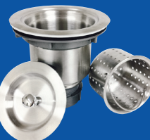
Basket Strainers Stainless Steel Construction