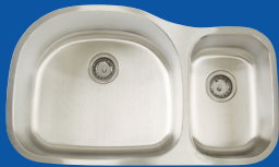
AR3521-D9/7 Large Bowl: 21-1/2" x 19" x 9"D Small Bowl: 10-1/2" x 16" x 7"D