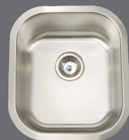
MH1618 D8 Bar Sink 13-1/2" x 15-3/4" x 8"D with choice of above faucets (excludes soap dispenser and grid)