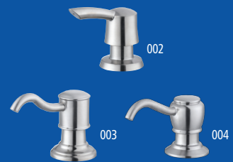
Your choice Soap Dispenser (1) Dispenses soap or lotions