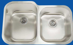
AR3221-D10/8 Large Bowl: 14-1/2" x 18" x 10"D Small Bowl: 13-1/2" x 15-3/4" x 8"D